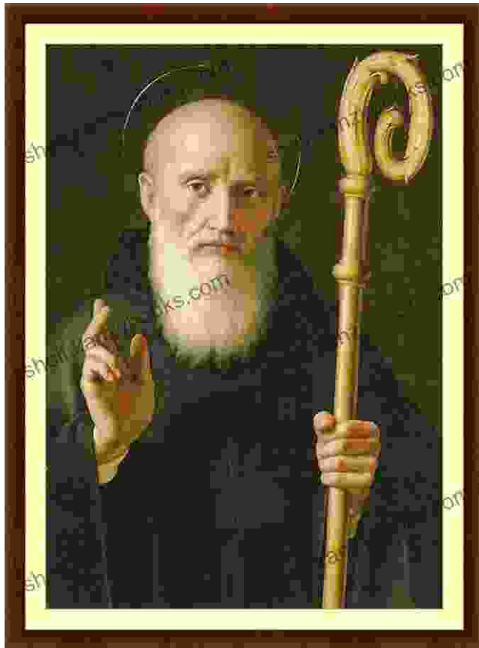
The Benedictine Way of Life

The Benedictine Rule is a practical and spiritual guide to monastic life. It emphasizes obedience, humility, and the importance of community. Benedict believed that monks should live in a balanced environment of prayer, work, and study. This approach to monasticism proved to be highly influential, attracting followers from all walks of life.