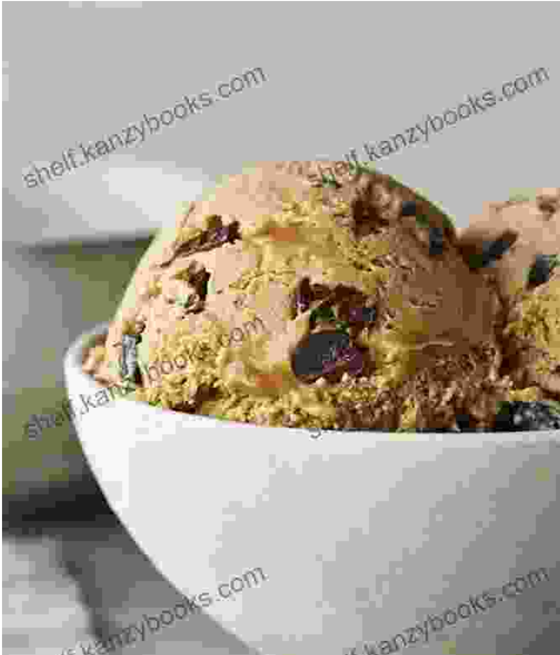
Espresso Tiramisu Ice Cream Cake